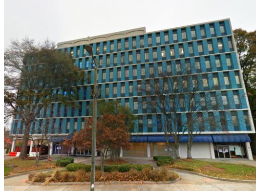
Sheffield Medical Building with its famed blue tile, as it appeared in December 2016.

But historic preservation is not just a movement about buildings and the past - It is about people and the future. We invite you to join us as we continue to advocate for the structures and stories that define Buckhead's history. Join or renew your membership today!