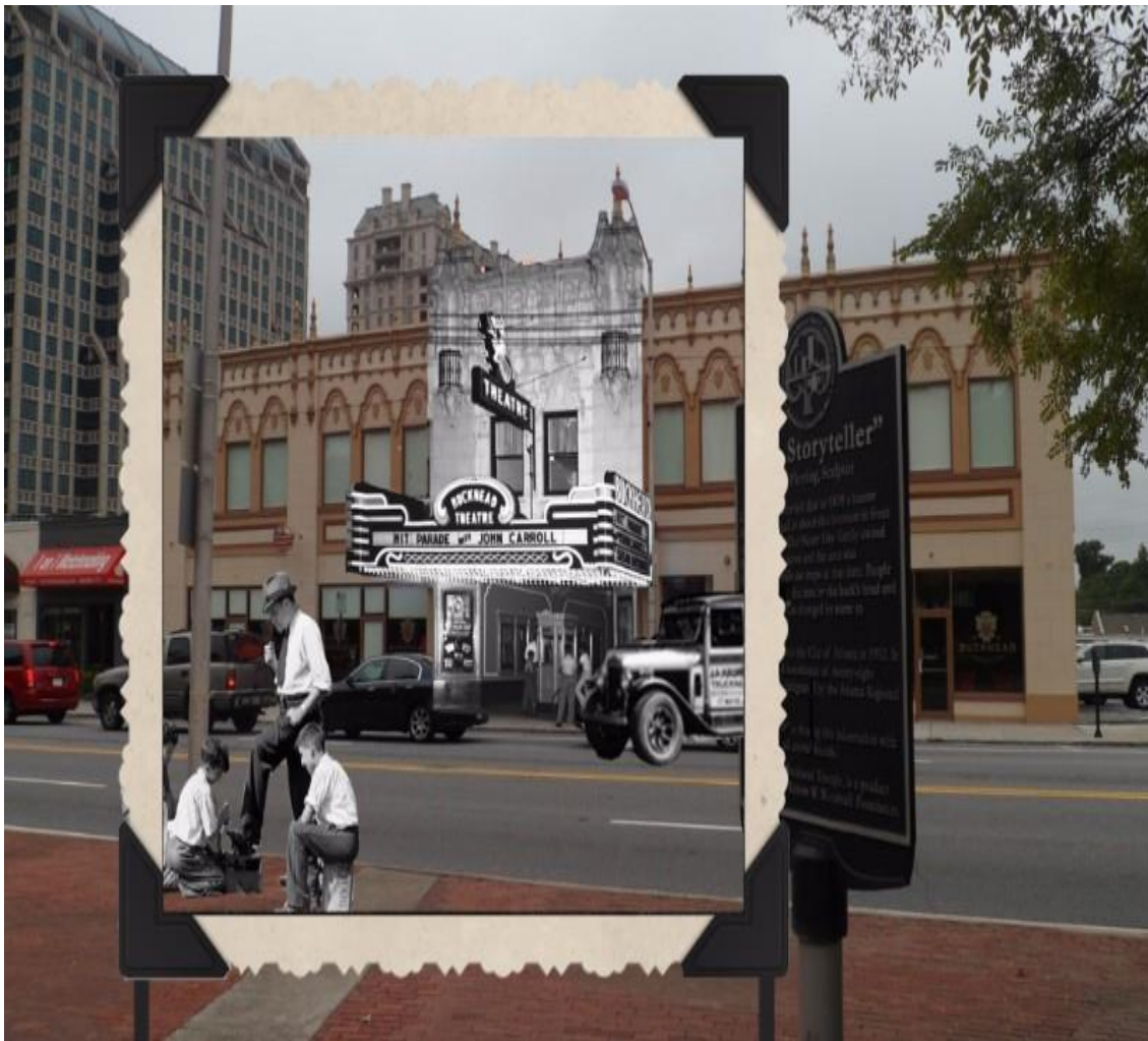
The first installation of Buckhead Story Lines shows a historic view of the Buckhead Theatre from Loudermilk Park.