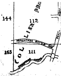
Plat of Land Lots 111, 112 and 113 from the Atlanta Constitution, May 22, 1910.