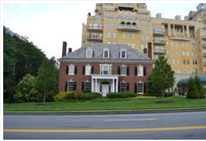
The Randolph-Lucas House is shown in its present location at 2500 Peachtree Road in front of the 2500 Peachtree condominiums.

NewTown Partners arranged for the preservation and moving of the home from the Condominium Association for 2500 Peachtree Road, which was granted a demolition permit to demolish the home last fall.