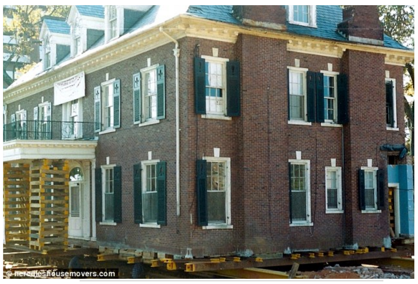
Old hat: The 1924 Federal Revival mansion was moved once before in 1997; a