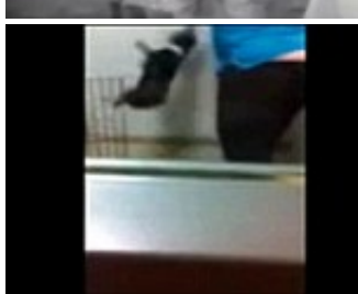
WARNING GRAPHIC: Horrific dog abuse caught on camera