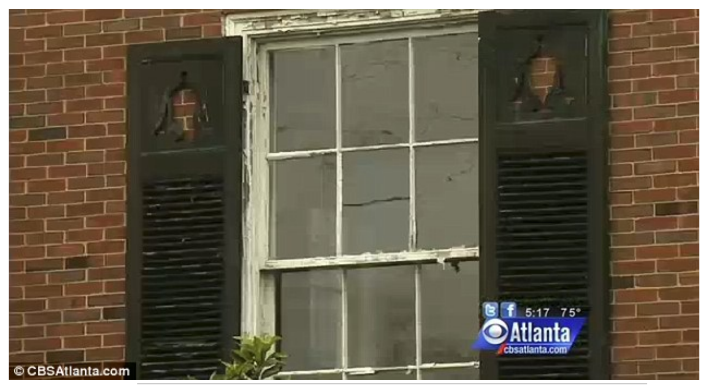
Fixer-upper: The house has been uninhabited for 25 years, after its last resident died; here, the shutters show obvious signs of wear

The association which owns the units claim the historic house is in poor condition, and are filing with the Atlanta Urban Design Commission to tear it down and instead replace it with an open-air pavilion for residents of the condos.