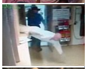
Caught on camera: Inmate escapes in dramatic jail break