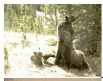
It's a bear party. Pole dancing grizzlies in Canadian...