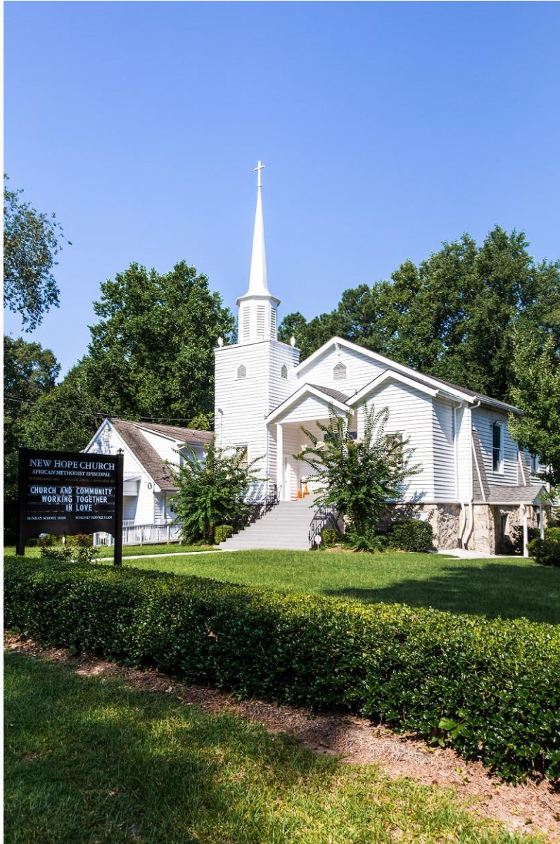
New Hope AME Church, Arden Road, Photo by Buckhead Heritage Staff