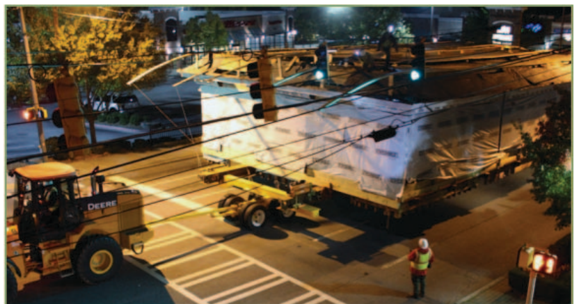
Randolph-Lucas House during its big move