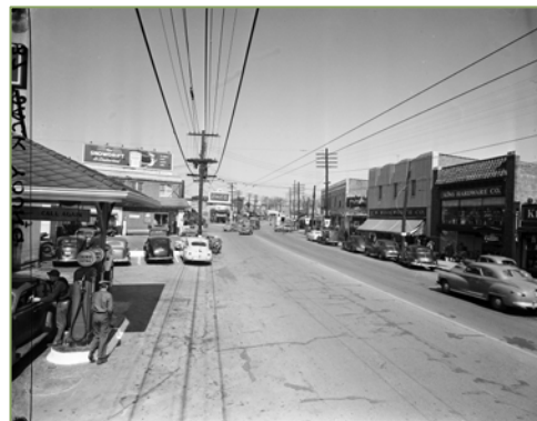
View looking north on Peachtree Road just south of the Peachtree Road and Roswell Road split, 1949.

After the end of WWII, Buckhead began to boom. People and businesses migrated to the community, spurred by an energized and expanding economy. In 1952, Buckhead was annexed into the City of Atlanta, which brought new city services and even more growth to the former rural outpost.