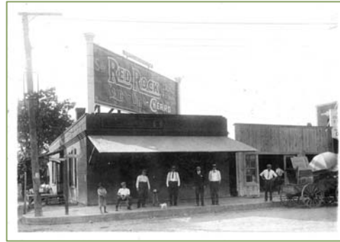
View of the northwest intersection of West Paces Ferry and Roswell roads, ca. 1910s.