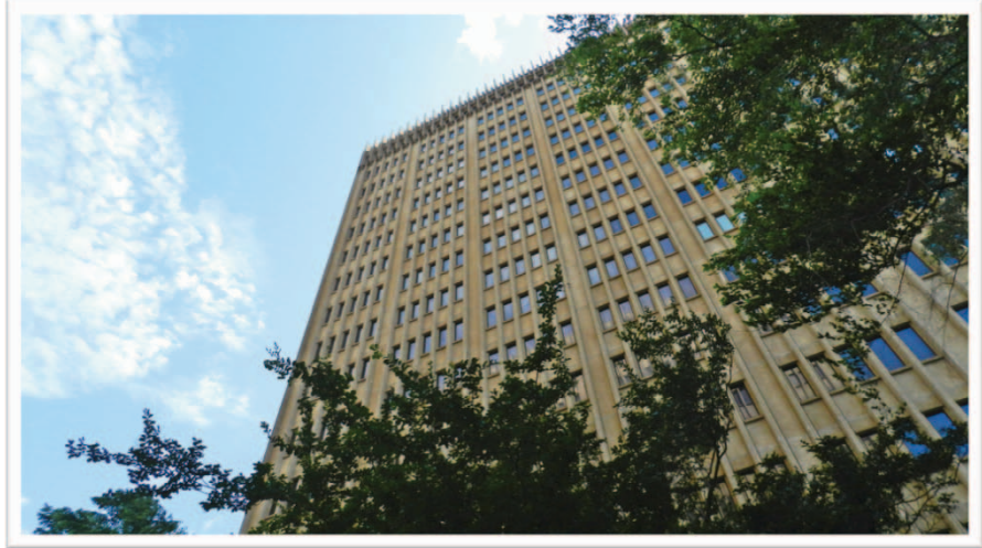
Lenox Towers, designed by Stevens & Wilkinson.

When Lenox Square opened in 1959, the Atlanta Journal proclaimed, “It is the first regional shopping center in the South and the largest south of New York.” It became a magnet for shops, restaurants, and office buildings around its perimeter and initiated a shift in Buckhead’s business center north from its historic core. In