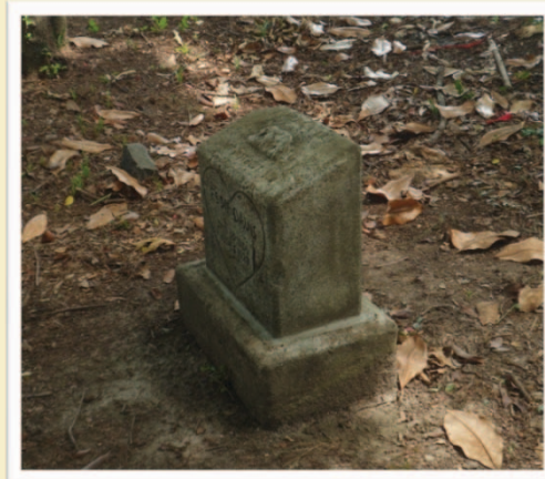
The gravestone of Essie Davis before and after stabilization and cleaning.