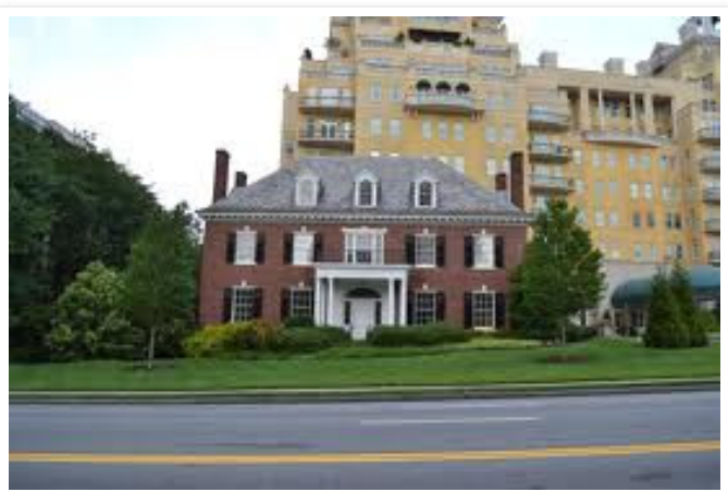
The Randolph-Lucas House is shown in its present location at 2500 Peachtree Road in front of the 2500 Peachtree condominiums.

NewTown Partners arranged for the preservation and moving of the home from the Condominium Association for 2500 Peachtree Road, which was granted a demolition permit to demolish the home last fall.