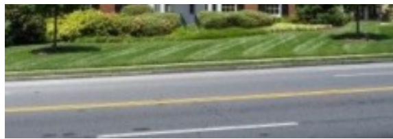
The Randolph-Lucas House on Peachtree Road in front of the 2500 Peachtree Condominiums at Peachtree and Lindbergh.

The city ordinance that governs the demolition or moving of a "historic" structure in the City of Atlanta provides that, after a 45-day "review and comment period" by the AUDC, and regardless of whether those comments are