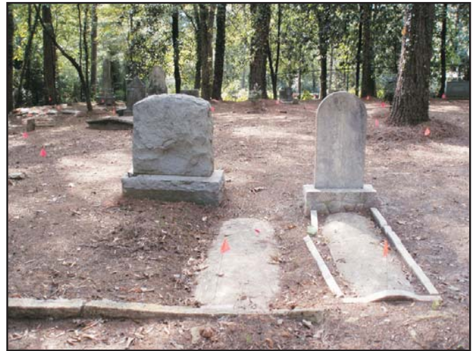
B. Concrete Coverings on Features 12b and 13, View West.