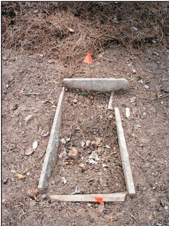
C. Marble Edging Around Feature 72, View West.