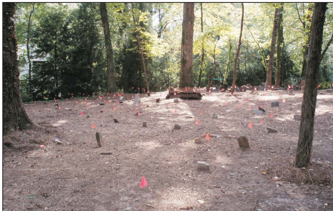
B. Fieldstones in Southern Half of Cemetery, View Southwest.