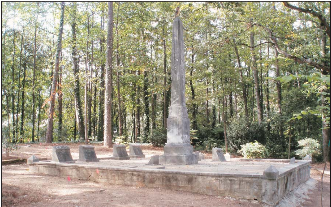
B. Sims Plot, View Northwest.