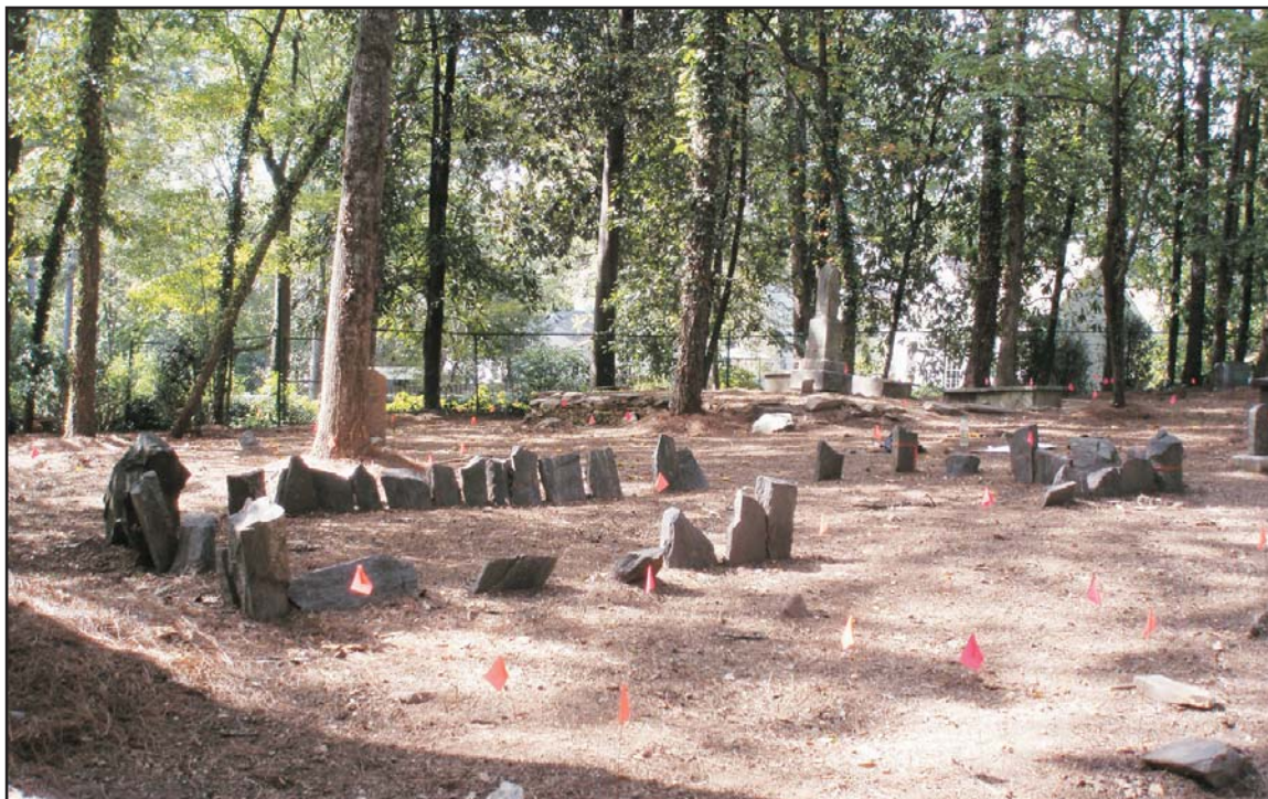
A. Standing Stone Plot, View Northwest.