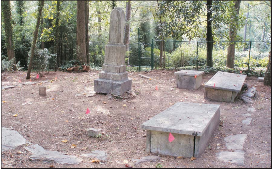
A. Smith Plot, View Southwest.