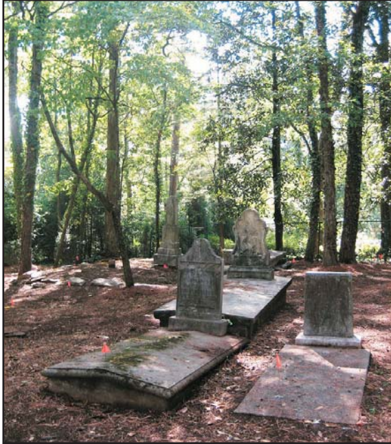
A. False Crypts (Features 117 - 118 at left), View Southwest.