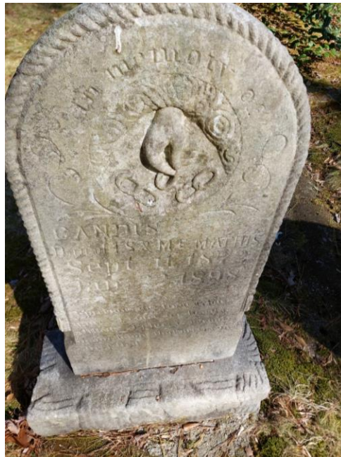
Harmony Grove Cemetery, Buckhead.